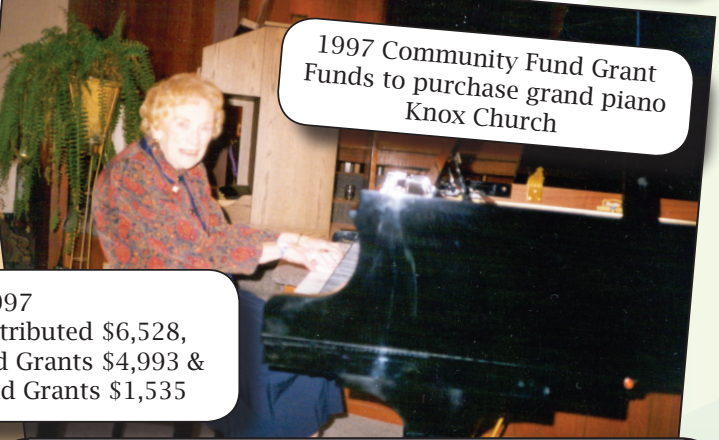
1997 First grants distributed $6,528, Community Fund Grants $4,993 & Designated Fund Grants $1,535

Town of Neepawa proclaims November 9-15, 2020 BPCF week honouring 25 years of community service