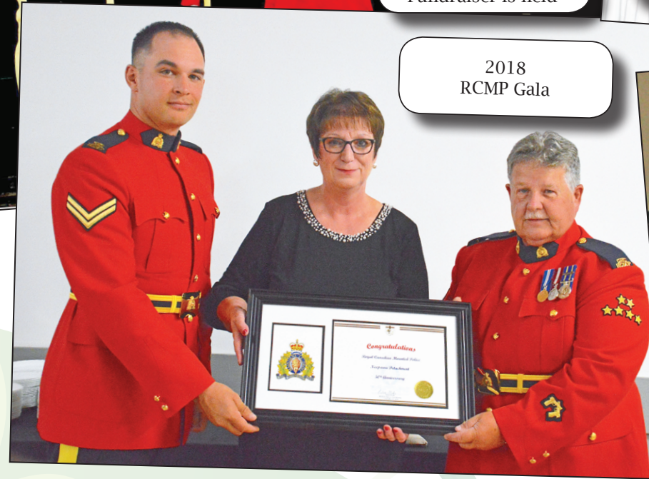
2018 RCMP Gala