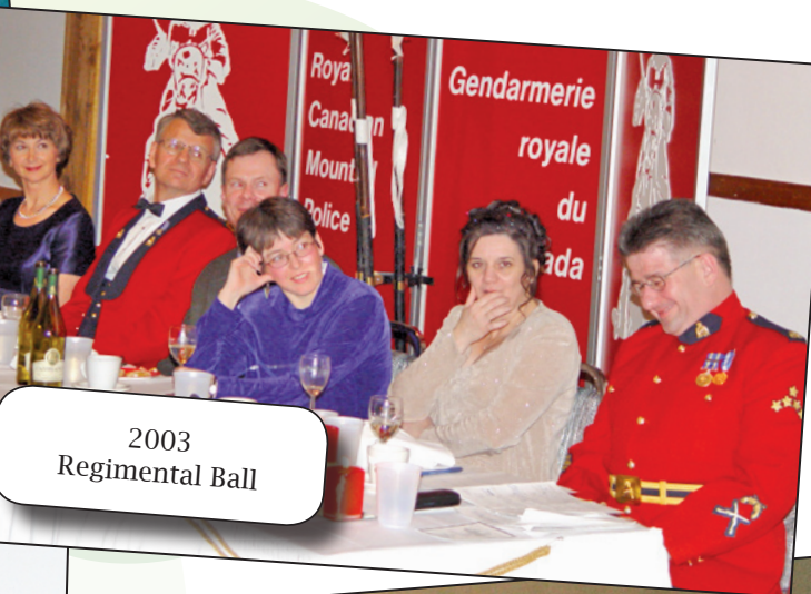
2003 Regimental Ball