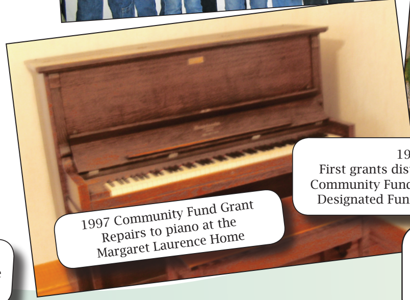
1997 Community Fund Grant Repairs to piano at the Margaret Laurence Home